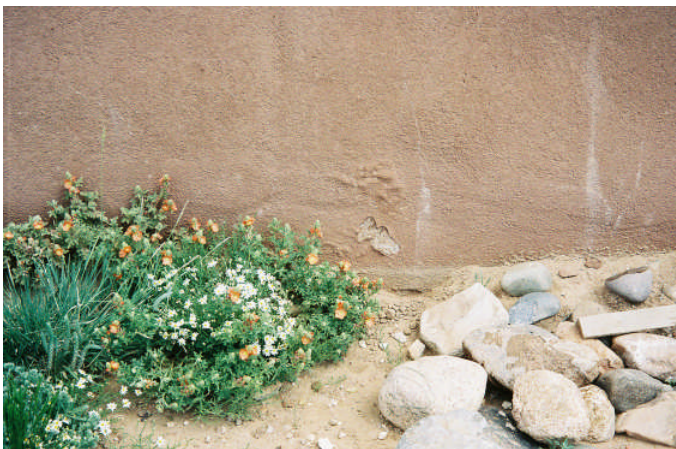
Photo 1: The blistered area at the base of this wall can be removed with a hand tool, and new color/texture matched finish applied to repair it. The likely root cause of this blister is ground water that seeps into the stem wall below and wicks up into the stucco. A canale (scupper) from the roof above drains water directly into the ground and not away from the wall. A diverter that directs water away from the wall would prevent recurrence.