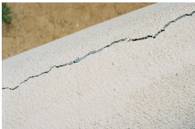
Photo 1: the large crack in the parapet requires elastomeric crack filler, followed by waterproofing with glass fiber mesh installed around the parapet and a minimum of 6" down each side.