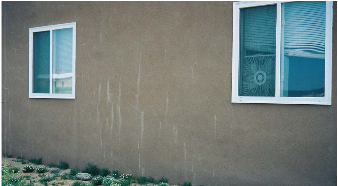
Photo 1: Efflorescence can be cleaned with a mild acid solution to remove unsightly stains on the exterior surface of the stucco.

Efflorescence can generally be removed by light washing with a cleaning agent. A common household solution is vinegar and warm water. Proprietary cleansers 1 are also available from a number of different sources (see notes below). Care should be taken to avoid heavy abrasion of the surface which could damage the integrity of the textured material. A soft bristle scrub brush should be used to scrub the affected area with the cleaning solution. Always try a small inconspicuous area first to be sure of desired results. When using proprietary cleansers follow the instructions and safety precautions on the packaging.