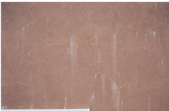
Photo 1: Cracks that are dispersed across a large area can be repaired with elastomeric coating if narrow in width (1/32" or less), Procedure A, or with glass fiber reinforcing mesh and acrylic base coat, Procedure B. Surface cleaning to remove the efflorescence and any other surface contamination must be done first.